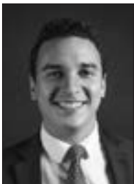
ALEX ARMAS Civitas Agency

501 Union Street, Suite 548 Nashville, TN 37219