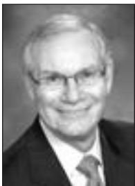
TIMOTHY L. AMOS Attorney / Uniform Law Commissioner